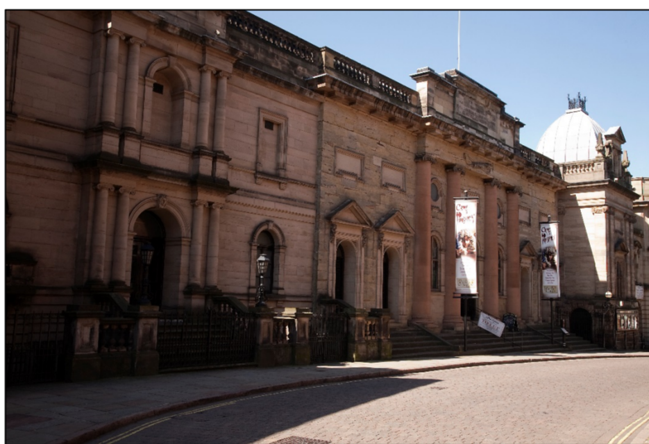
Galleries of Justice Museum (Free to attend for delegates)

Wednesday 7 th September Annual Conference Dinner