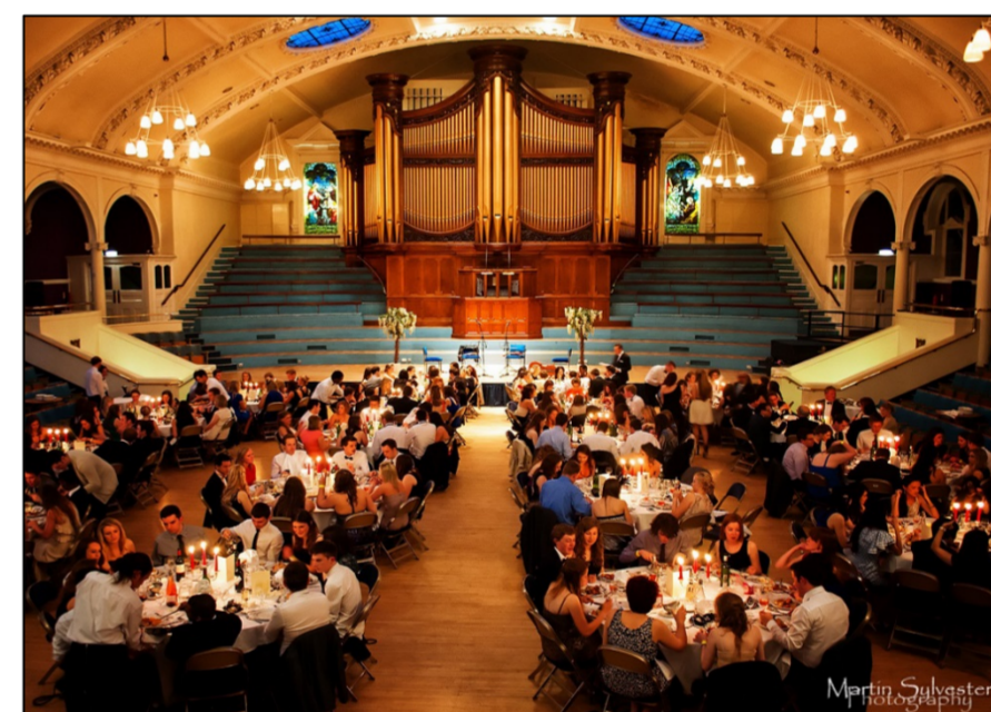
Albert Hall (Cost of £45 per head)

Wednesday 7 th September Annual Conference Dinner