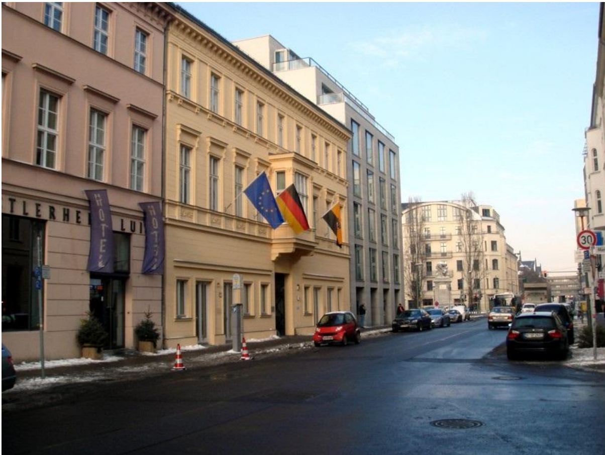
Anhalt Landesvertretung, Luisenstrasse 18, Berlin-Mitte, 10117 Berlin.