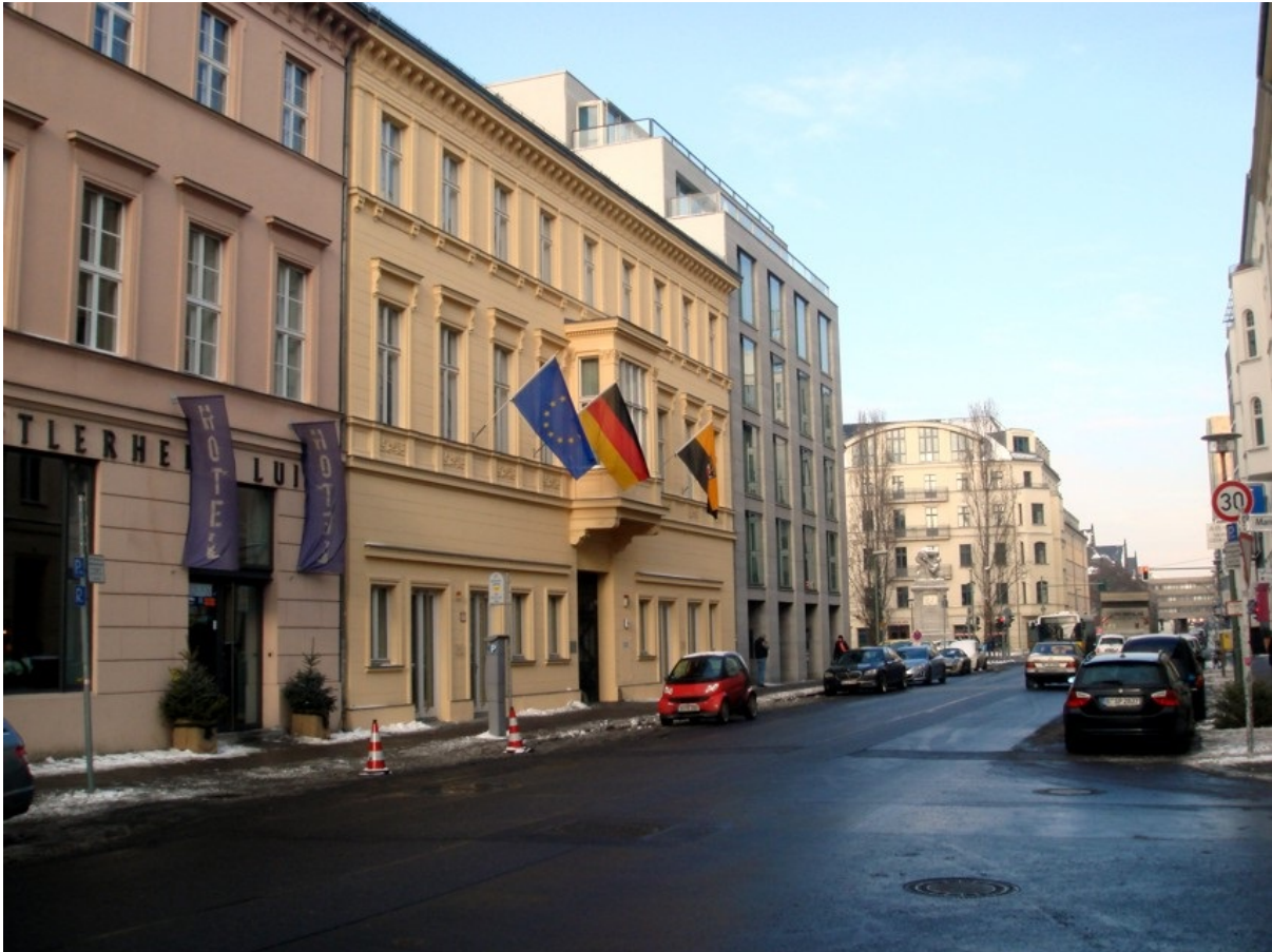
Anhalt Landesvertretung, Luisenstrasse 18, Berlin-Mitte, 10117 Berlin.